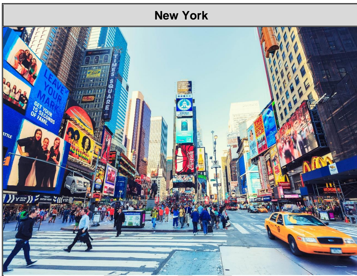
Picture-based Interview: Interlocutor Frame (für die prüfende Lehrkraft)